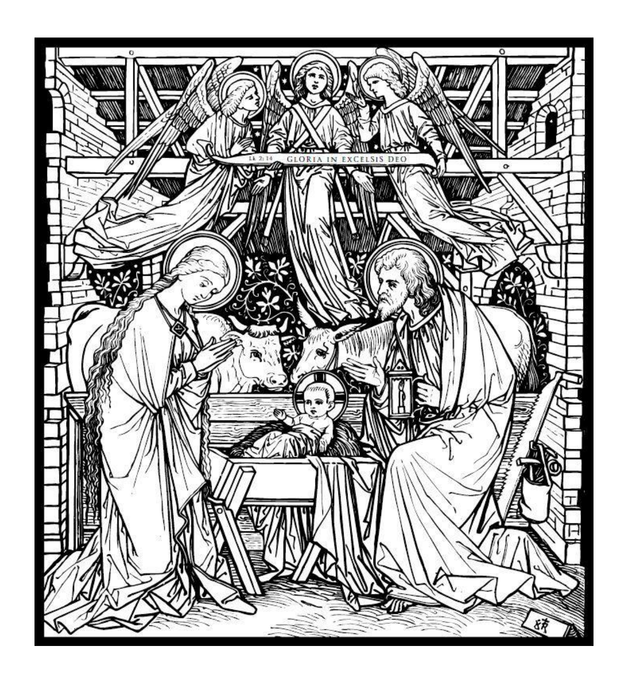
The Vigil Mass of the Nativity