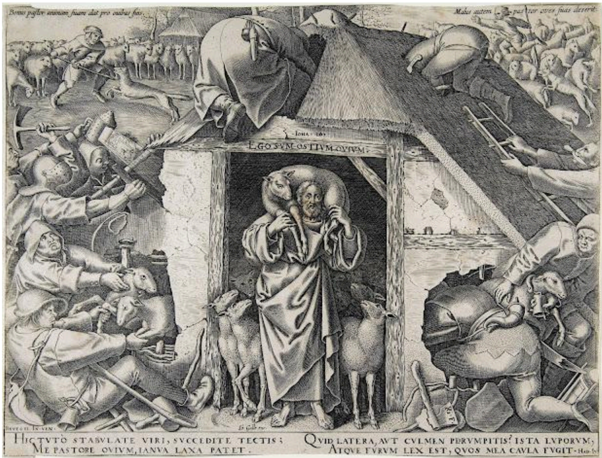
Pieter Bruegel the Elder Engraved by Philips Galle New York, Metropolitan Museum of Art